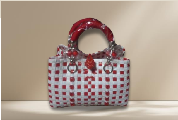
AJM21Red Size: 23x10x17 cm

From contemporary designs to classic styles,