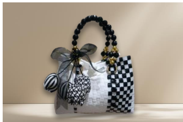
AJB12Pearl Size: 23x10x17 cm

Elegant woven bag with pearl-like texture, designed for both casual and formal occasions.