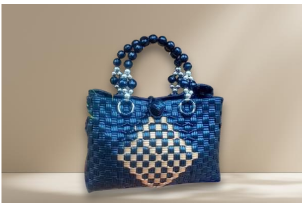
AJB11Pearl Size: 23x10x17 cm

A neutral brown variant, providing a timeless and versatile look.