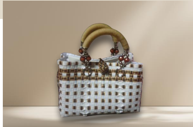
AJM22Brown Size: 23x10x17 cm

A bold red woven bag that adds a pop of color to any outfit.